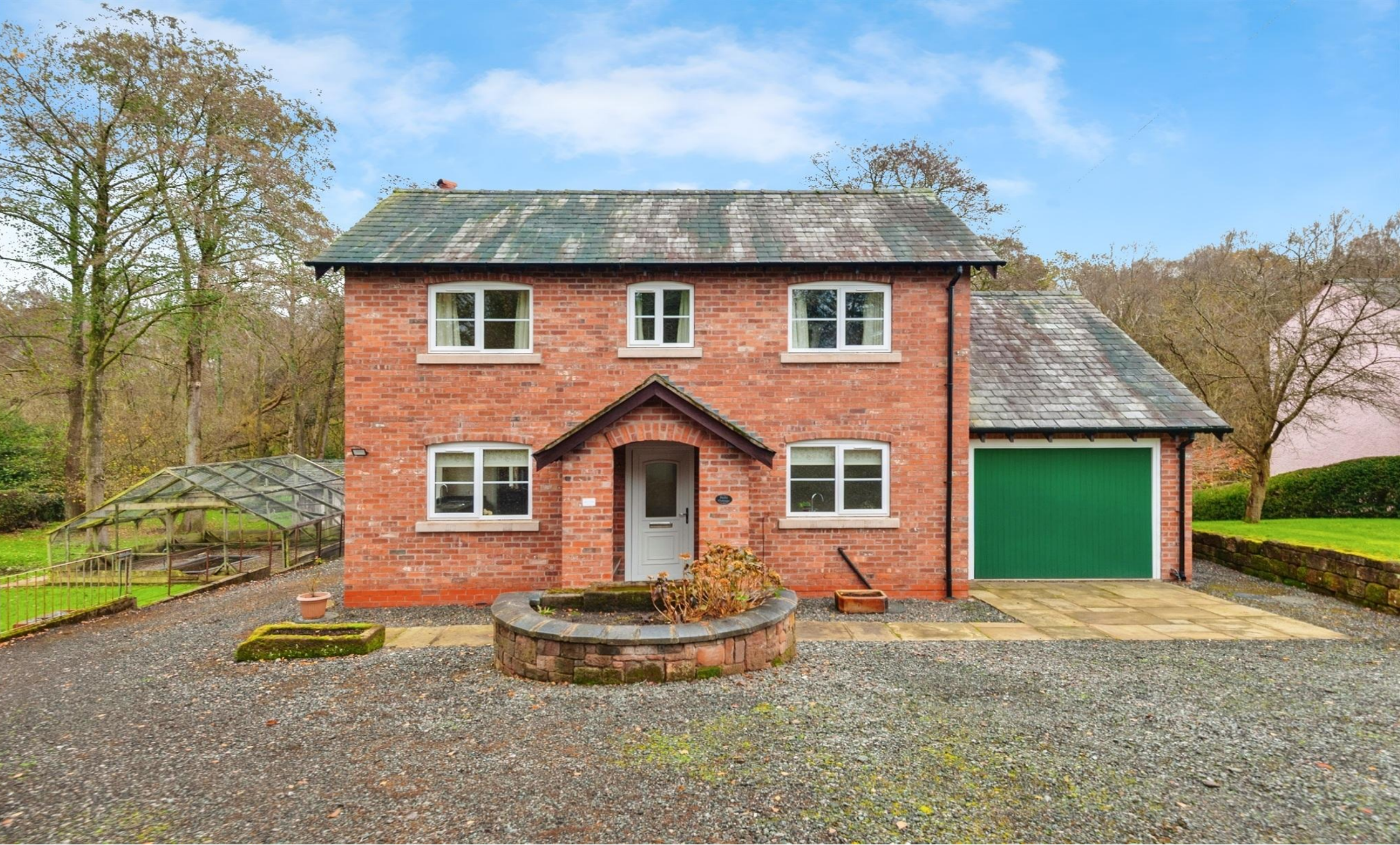
Holly Cottage Breech Moss Lane, Norley Frodsham WA6 8LR