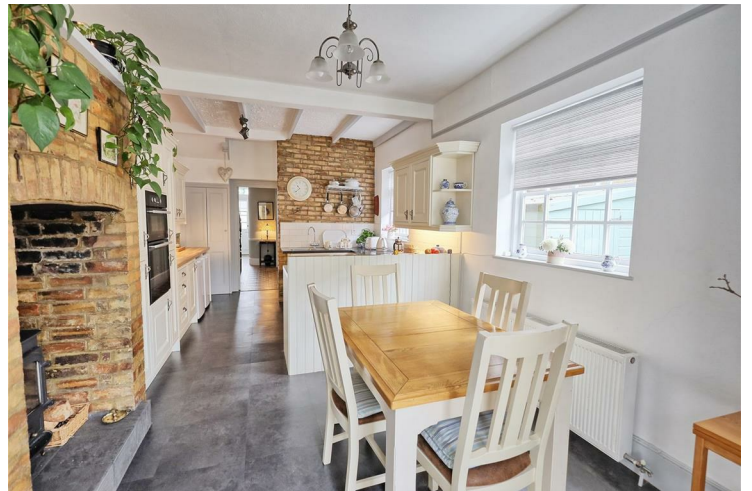
KITCHEN/BREAKFAST ROOM 24'10" x 11'10" (7.58 x 3.61)