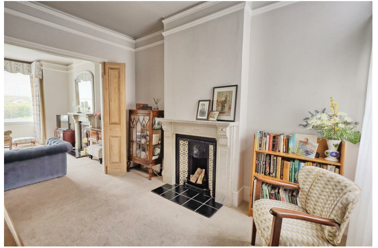
DINING ROOM 12'4" x 9'4" (3.78 x 2.85)