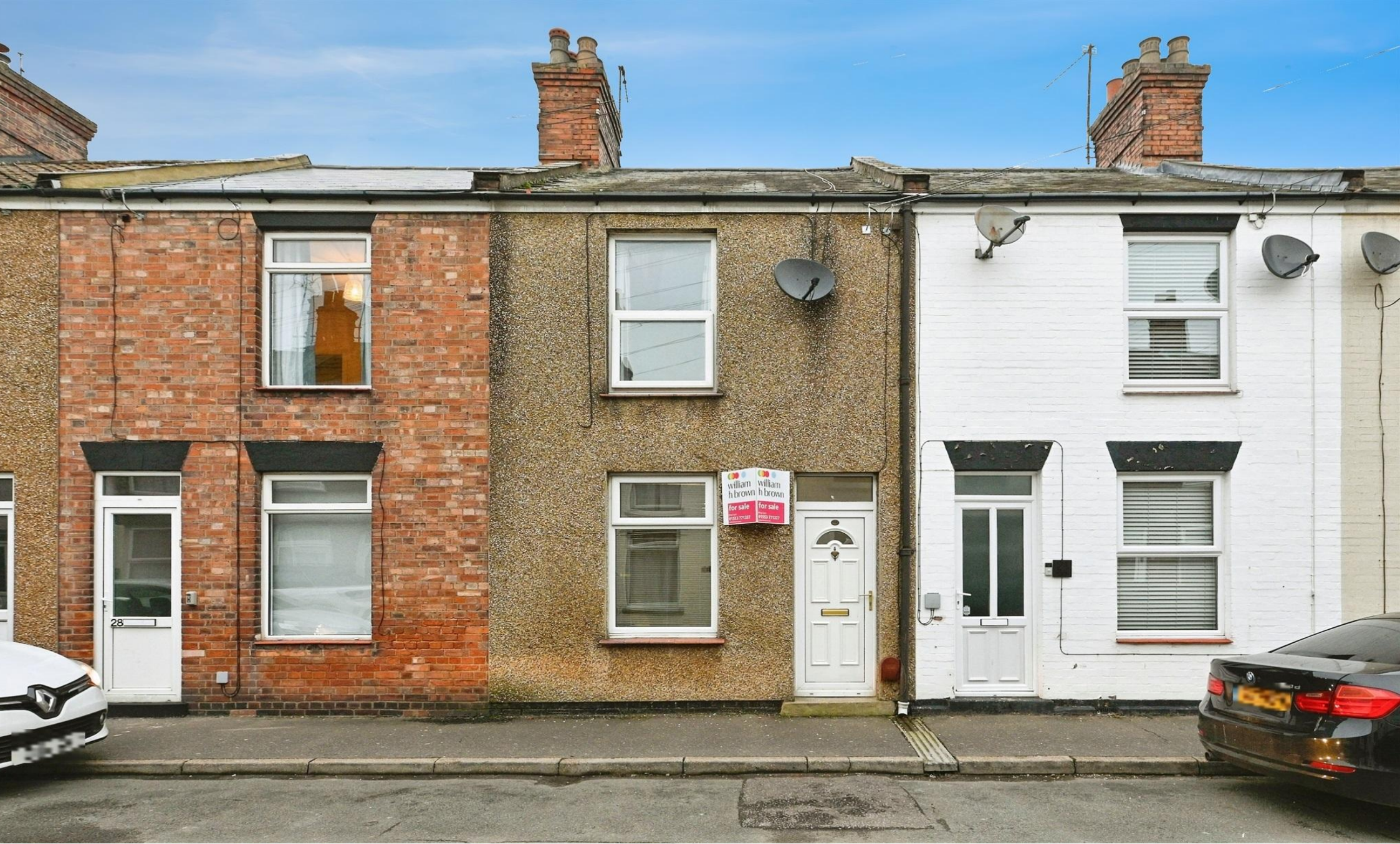
Hockham Street, King's Lynn, PE30 5LZ