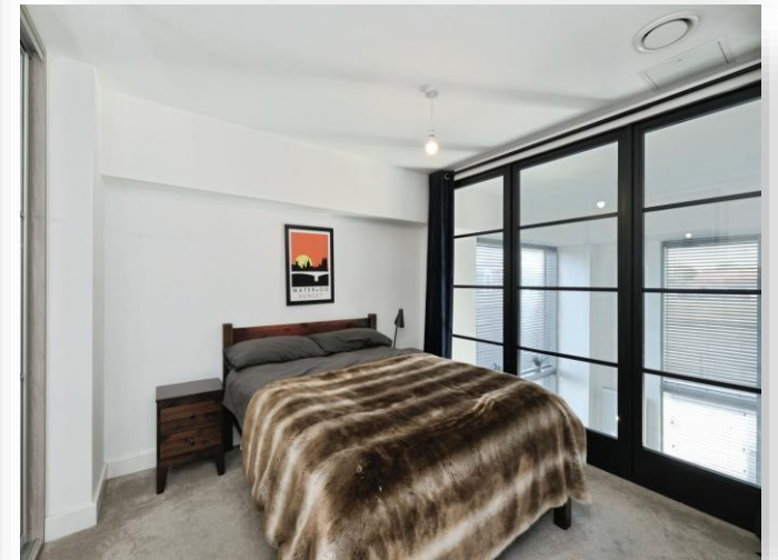
Trent Bridge View, Nottingham NG2 3EZ