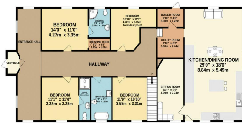
GROUND FLOOR 2096 sq.ft. (194.7 sq.m.) approx.