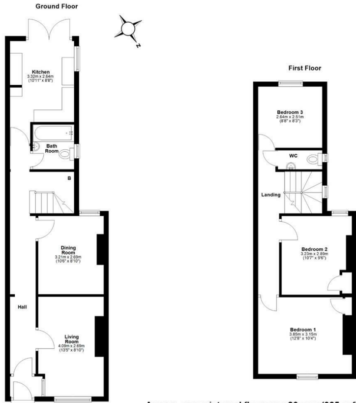
Approx. gross internal floor area 86 sqm (925 sqft)