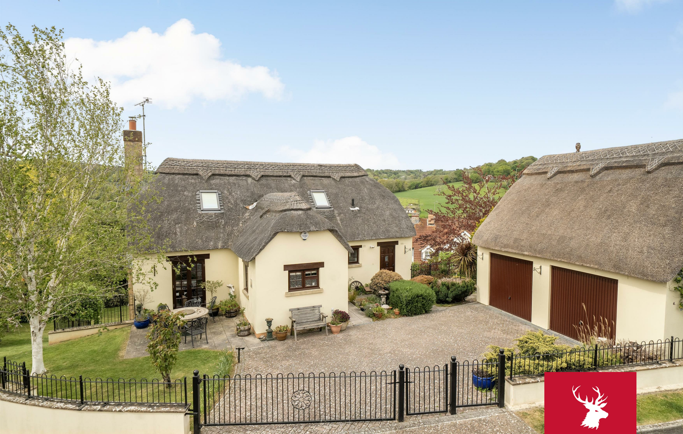
42, Barnes Meadow