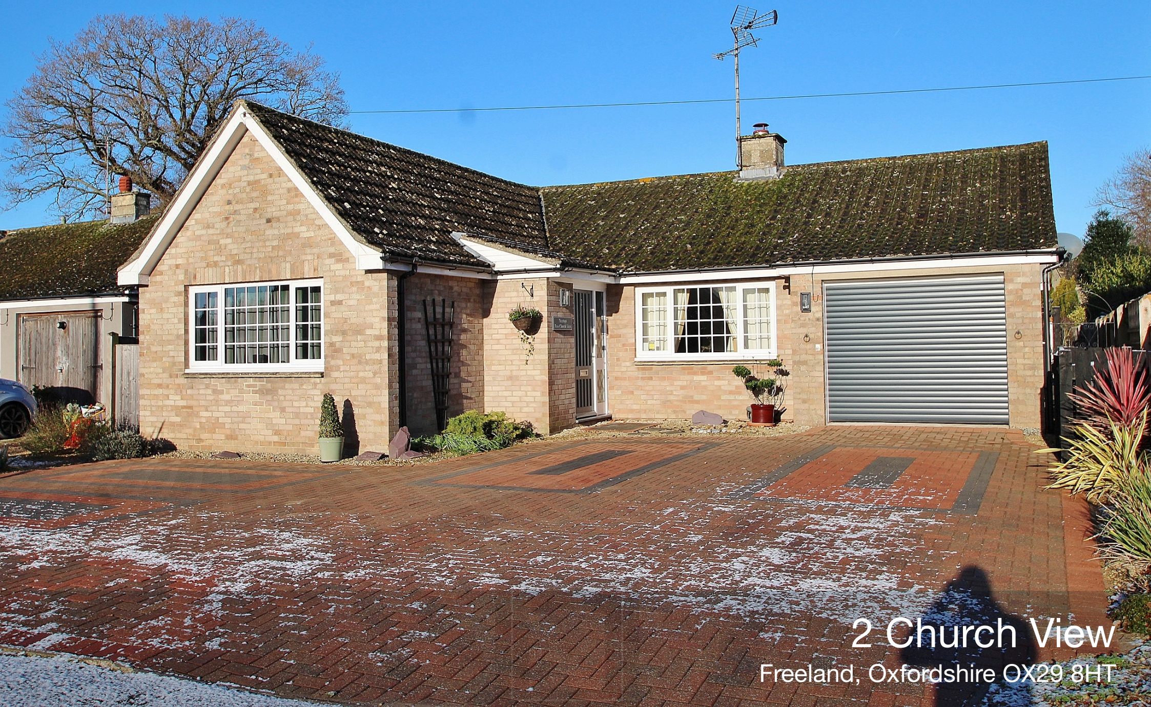
2 Church View Freeland, Oxfordshire OX29 8HT