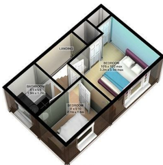
1ST FLOOR APPROX. FLOOR AREA 235 SQ. FT. (21.8 SQ.M.)

27 Mendelssohn Grove, Brownswood, Milton Keynes, Bucks, MK7 8DH 14355768 £1,095 PCM