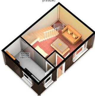
GROUND FLOOR APPROX. FLOOR AREA 240 SQ. FT. (22.3 SQ.M.)

TOTAL APPROX. FLOOR AREA 475 SQ. FT. (44.2 SQ.M.)