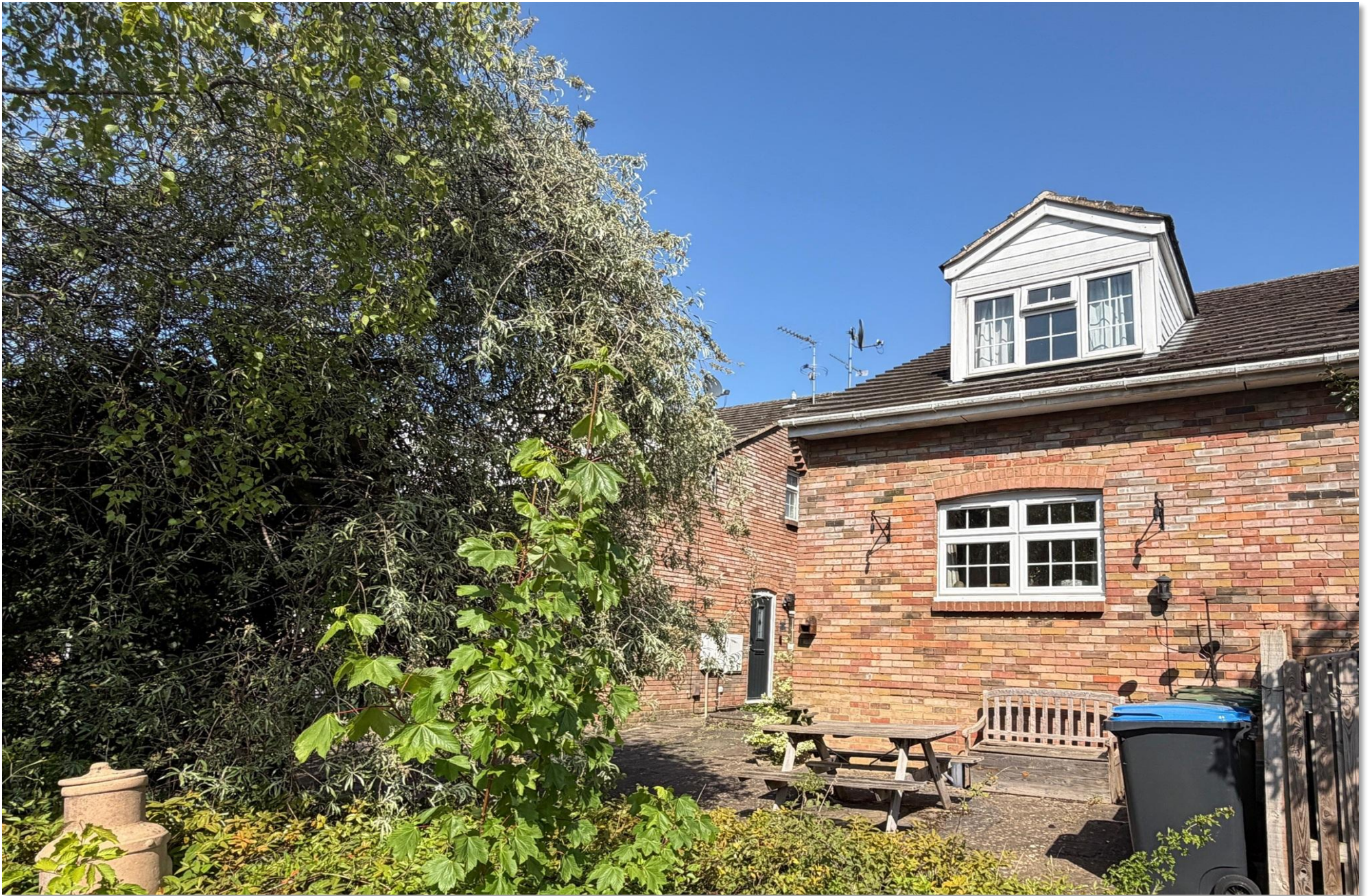
Hunters Close, Tring HP23 5QB