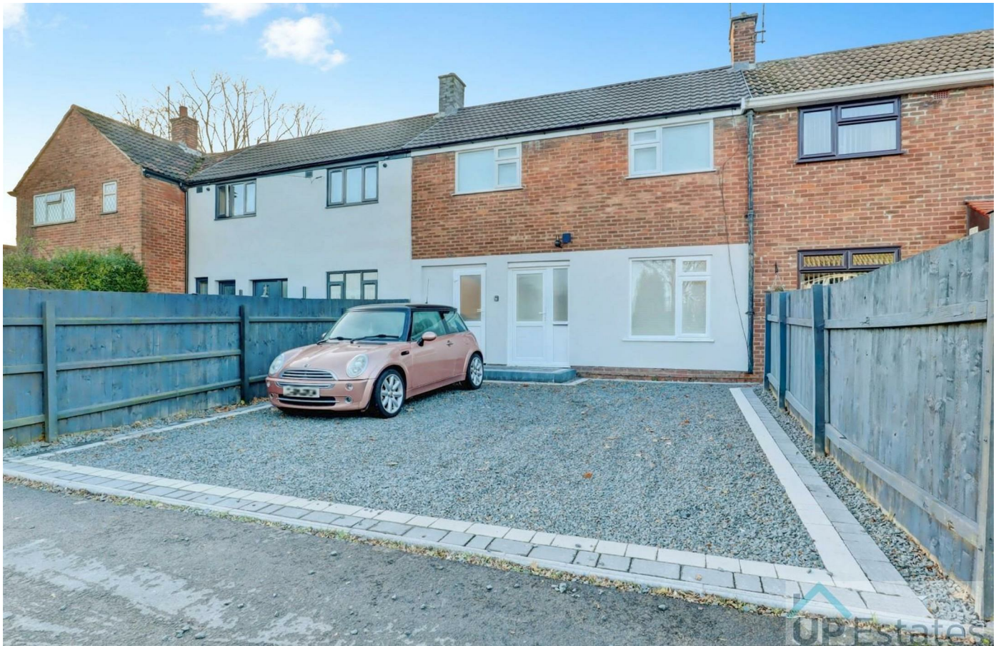
Cedar Road, Nuneaton