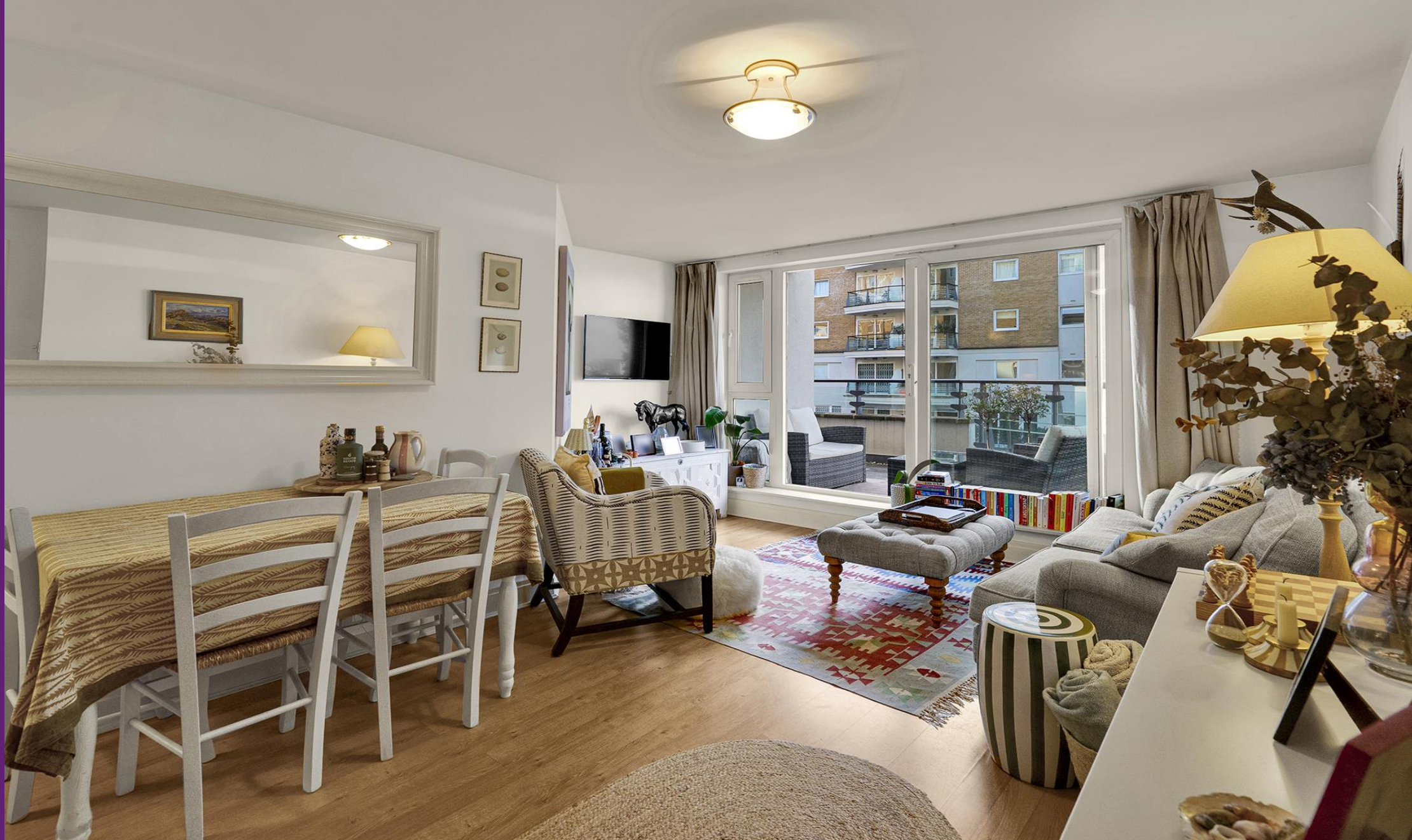
Compass House Smugglers Way, SW18