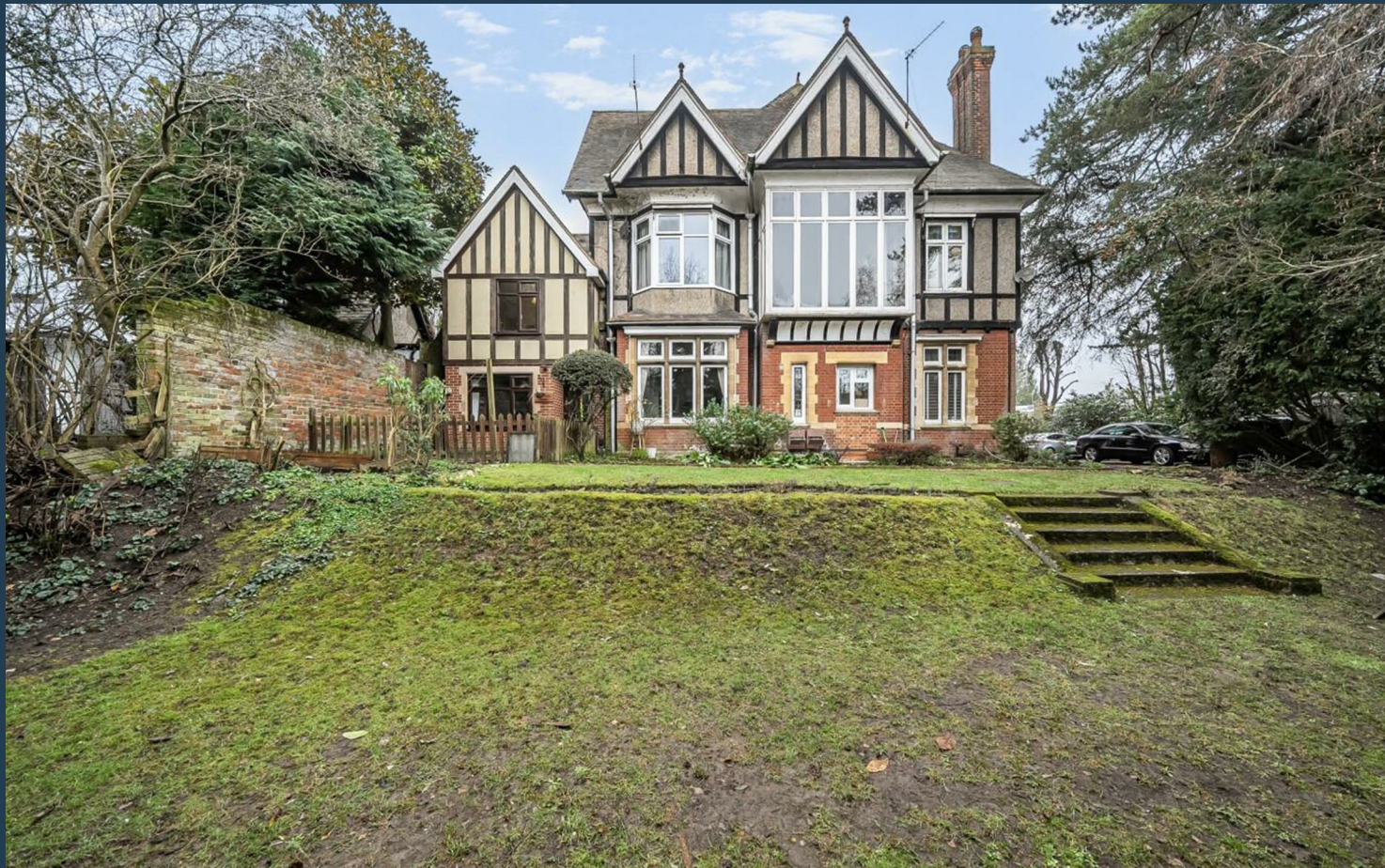
Cranley Lodge 2 Cranley Road, Guildford GU1 2EH