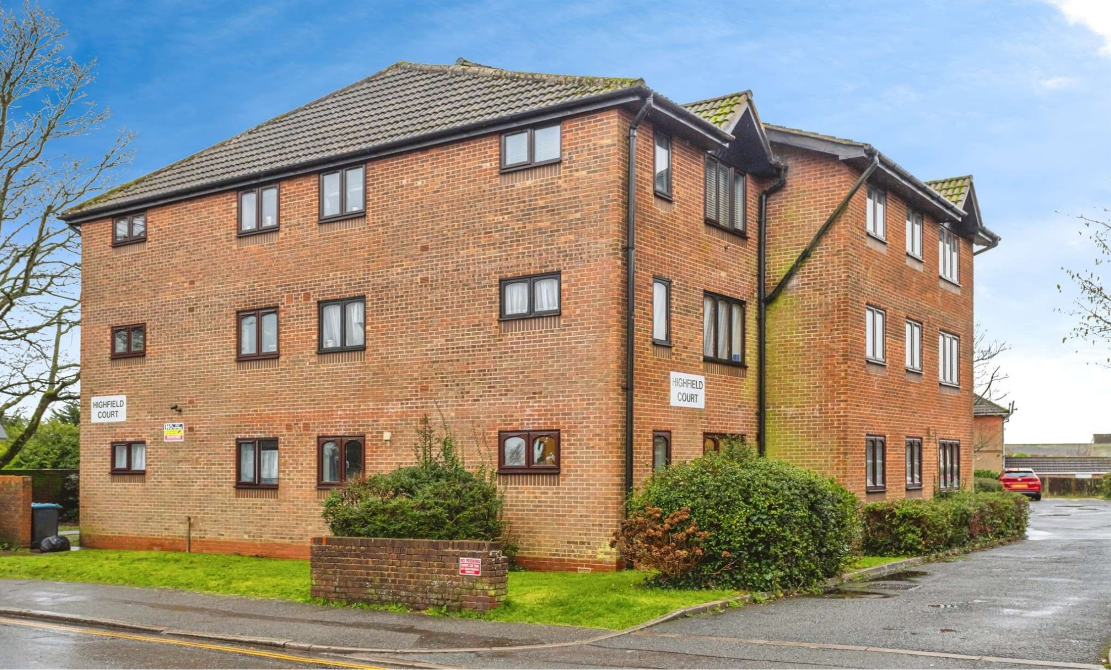
Highfield Court, Church Road, Haywards Heath RH16 3PA