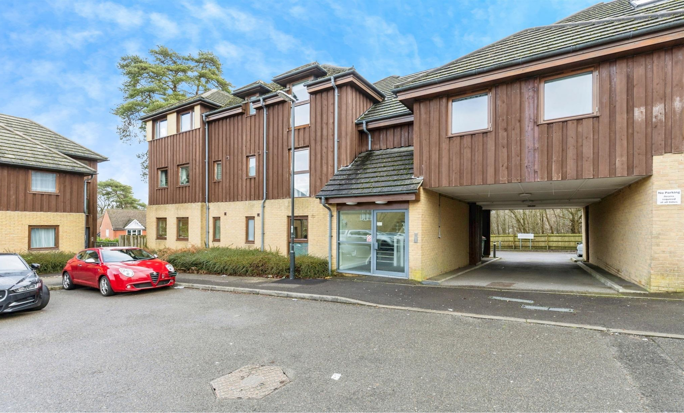
Oakwood Court, Crawley RH11 9TT