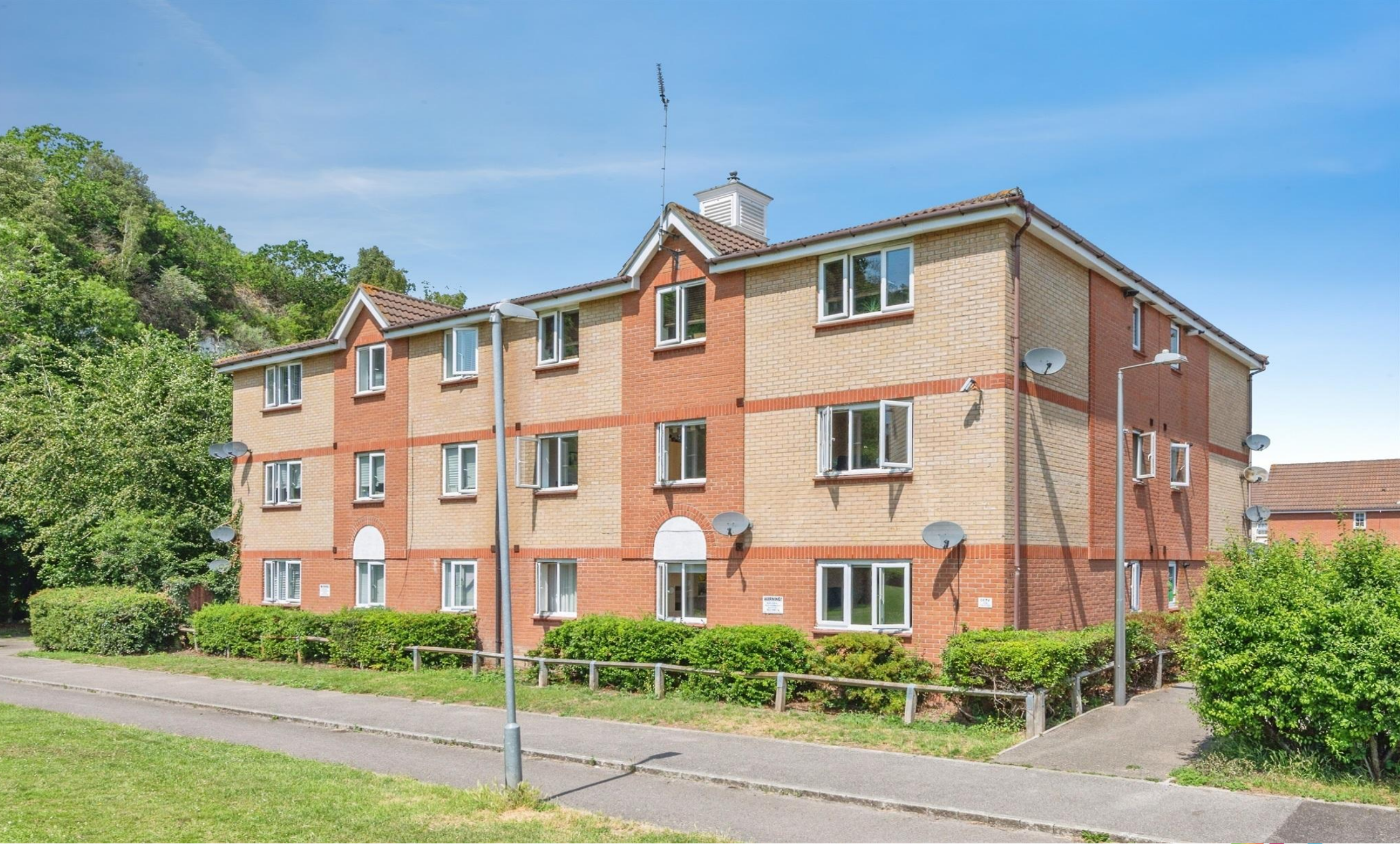
Frobisher Gardens, Chafford Hundred Grays RM16 6EY