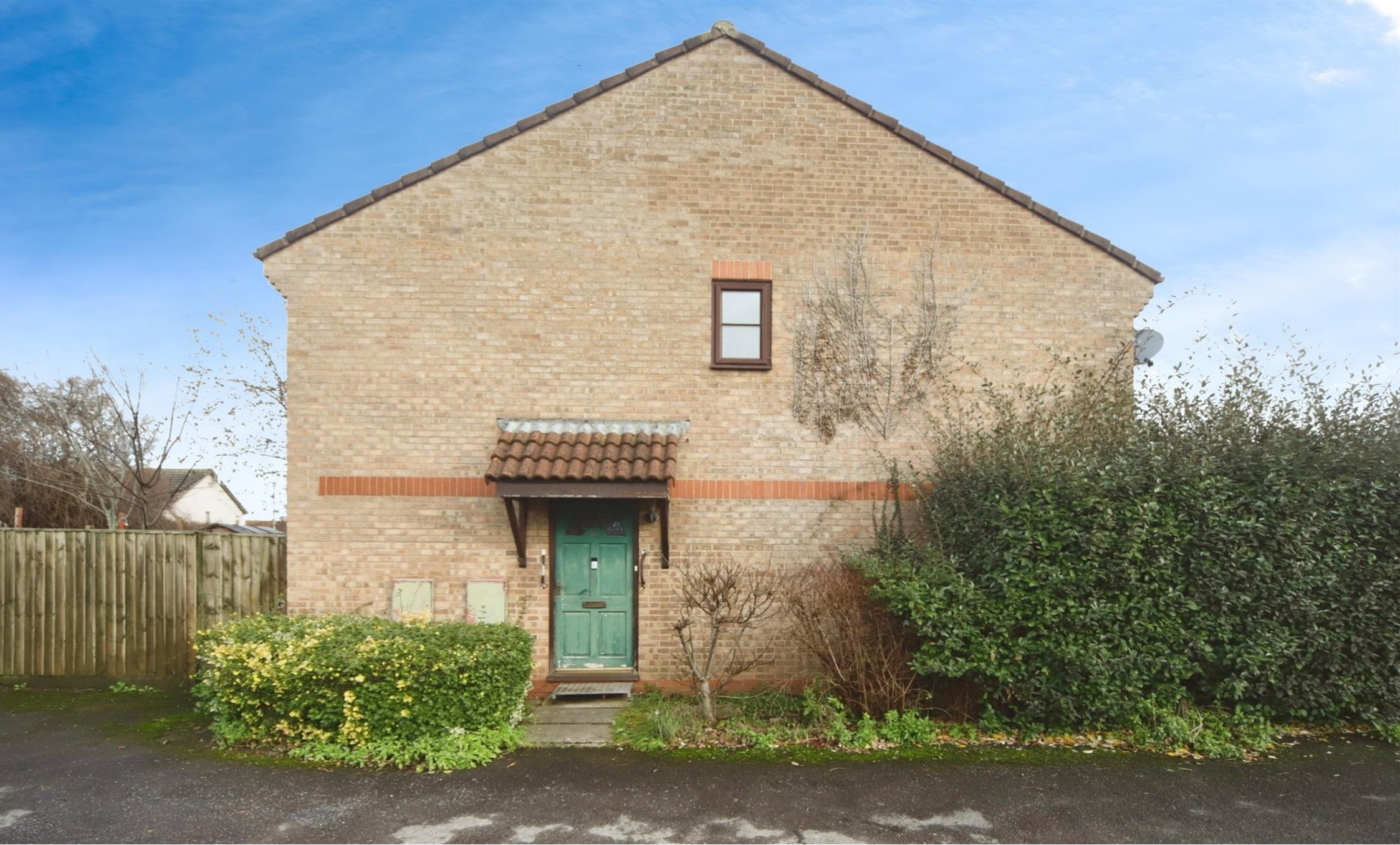
St. Margarets Court, Taunton TA1 2UD