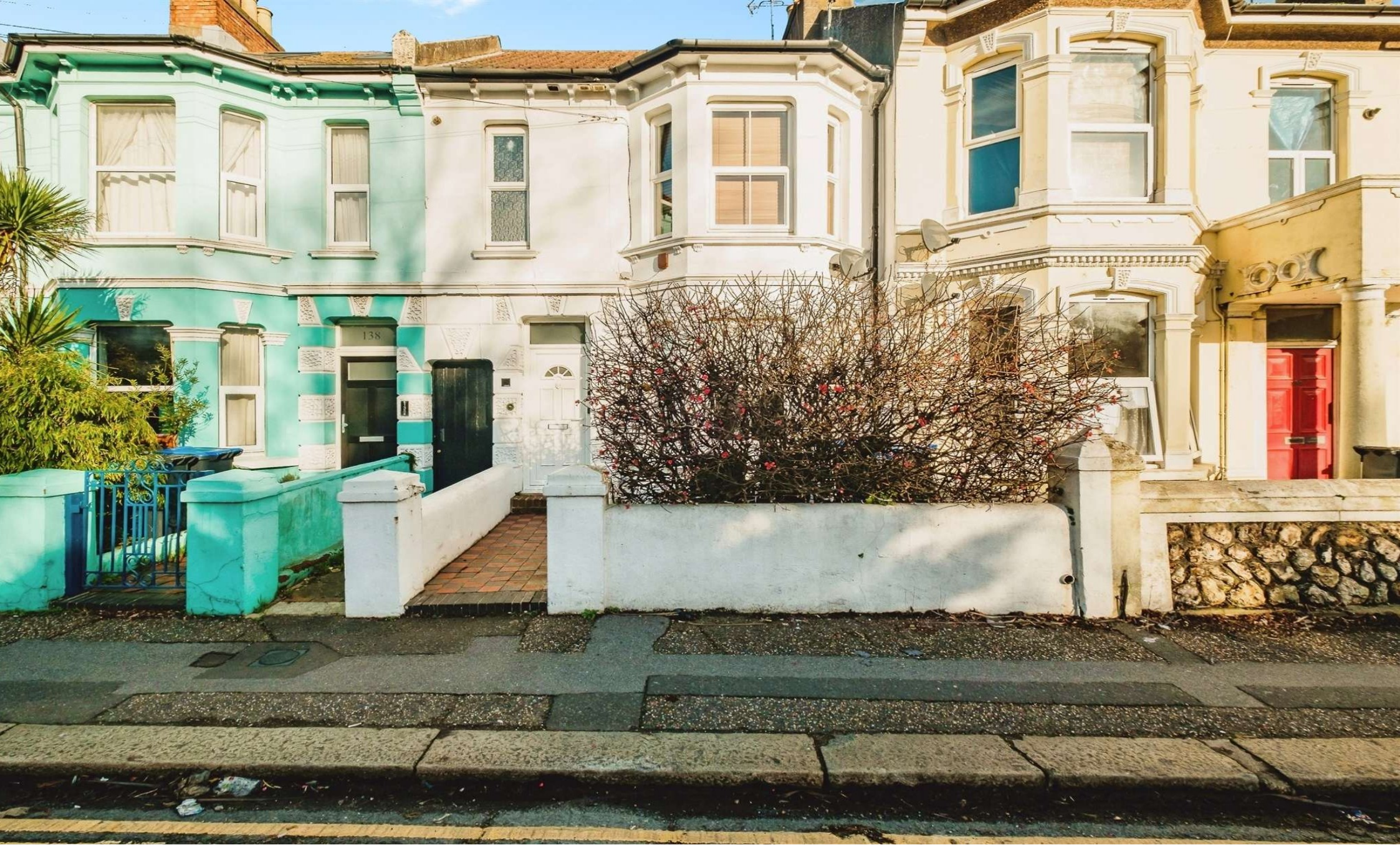
Tarring Road, WORTHING BN11 4HA