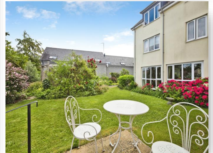
3 Tor View Court, Somerton Road, Street, BA16 0FE