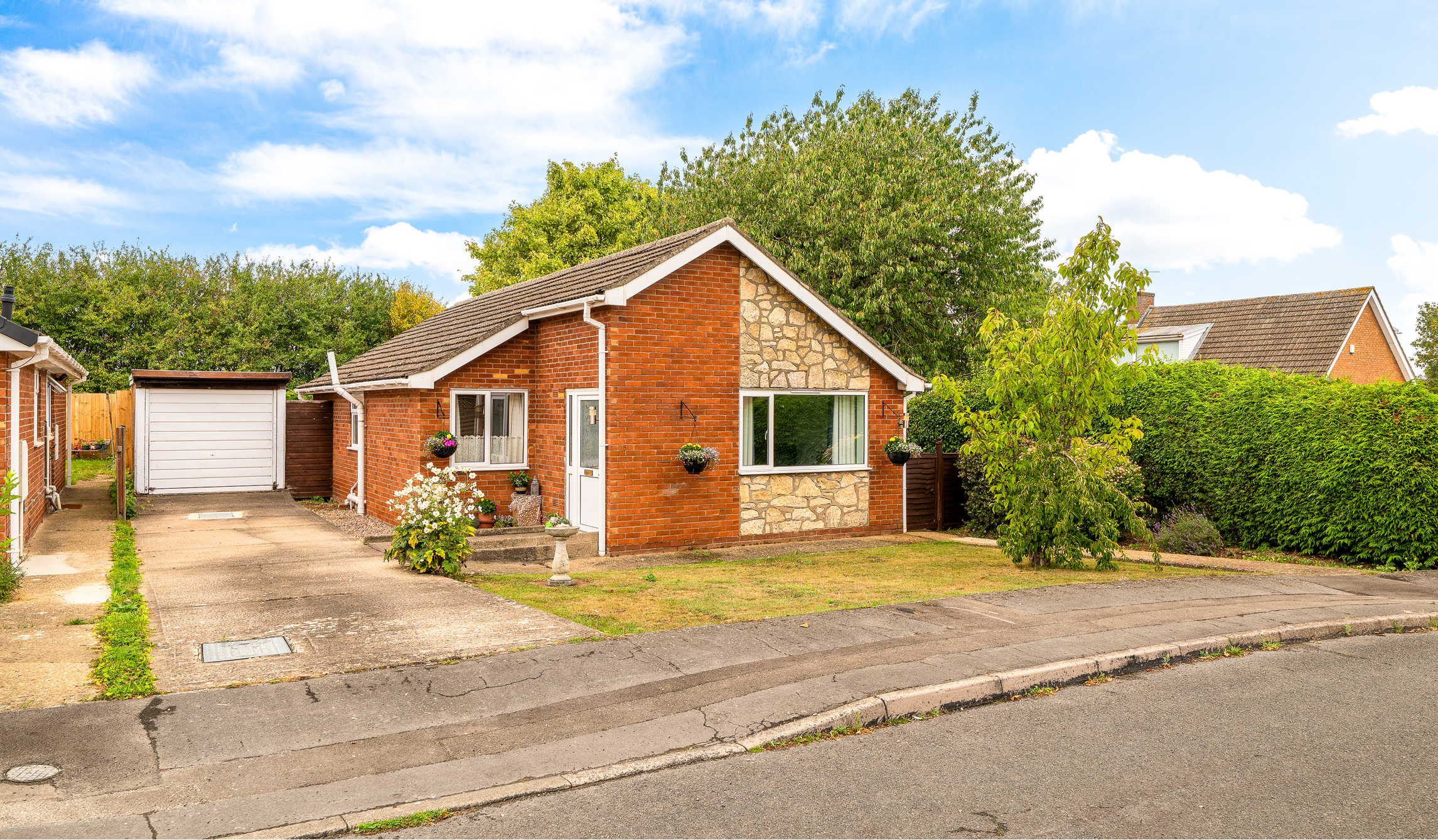
15 Flintham Close Metheringham, Lincoln