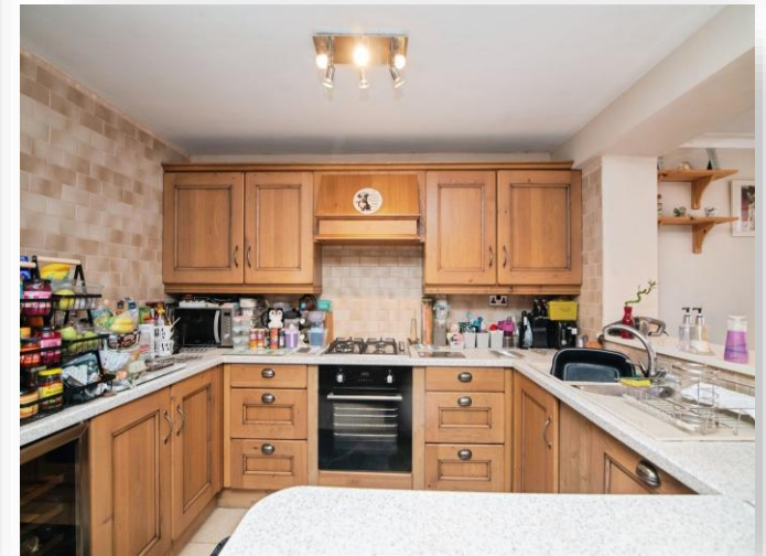
Foredraft Close, Birmingham B32 3TP