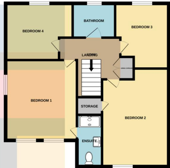
1ST FLOOR 656 sq.ft. (60.9 sq.m.) approx.