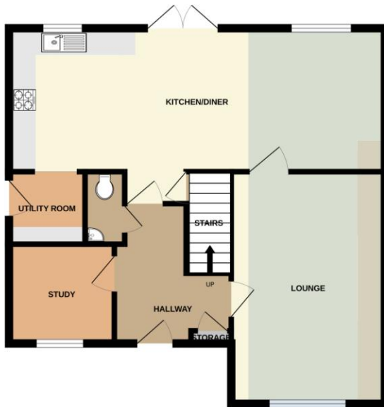
GROUND FLOOR 638 sq.ft. (59.3 sq.m.) approx.