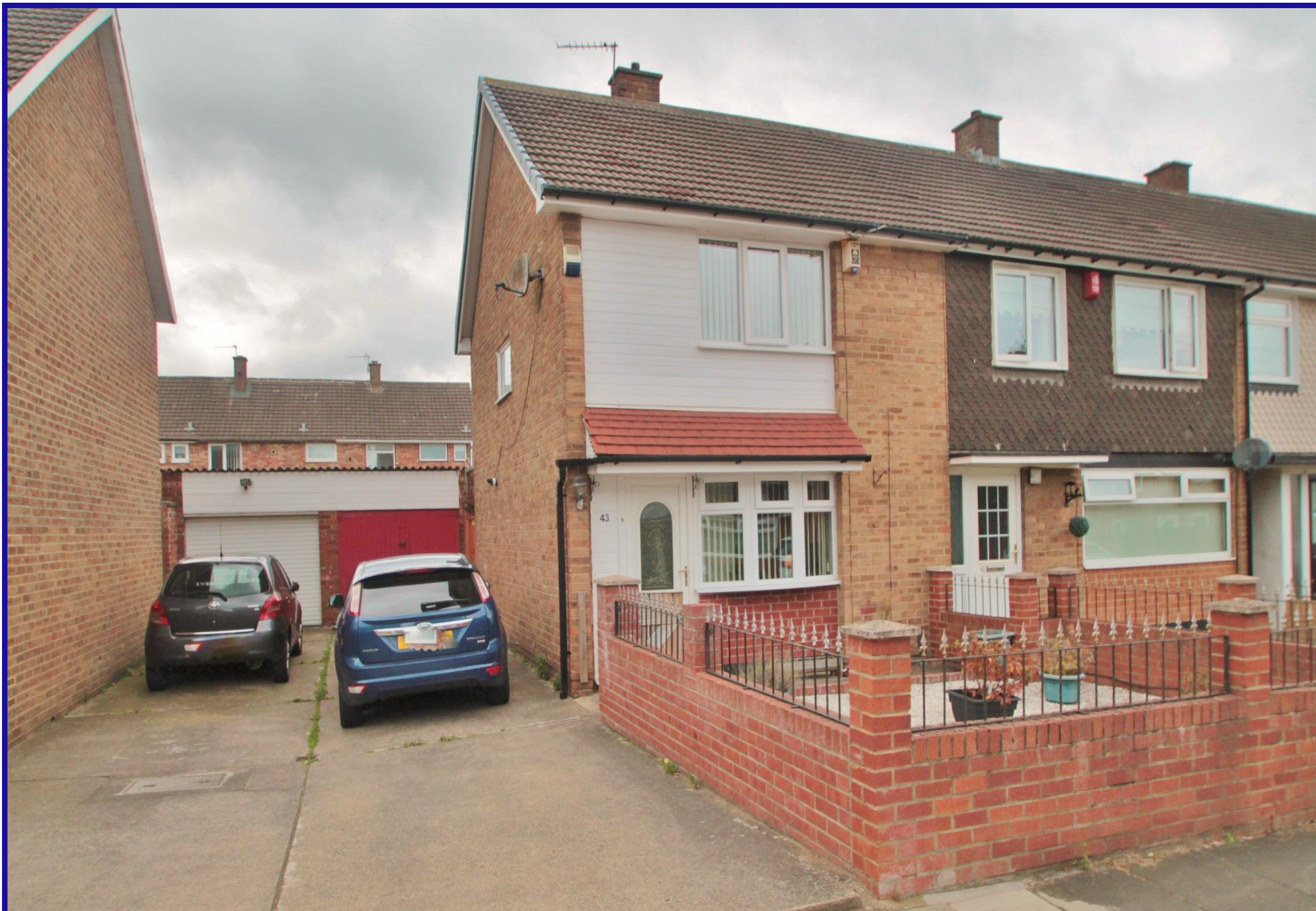
43 Darnton Drive, Easterside , Middlesbrough, Middlesbrough, TS4 3RF Monthly rental £495