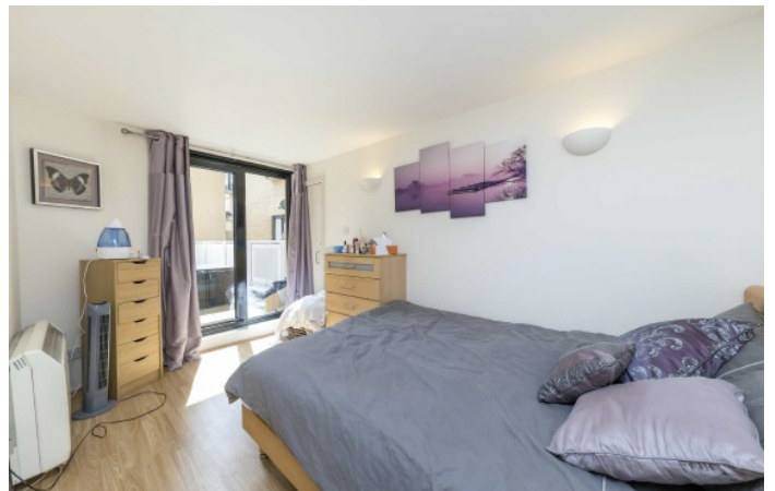
Cromwell Road, SW7