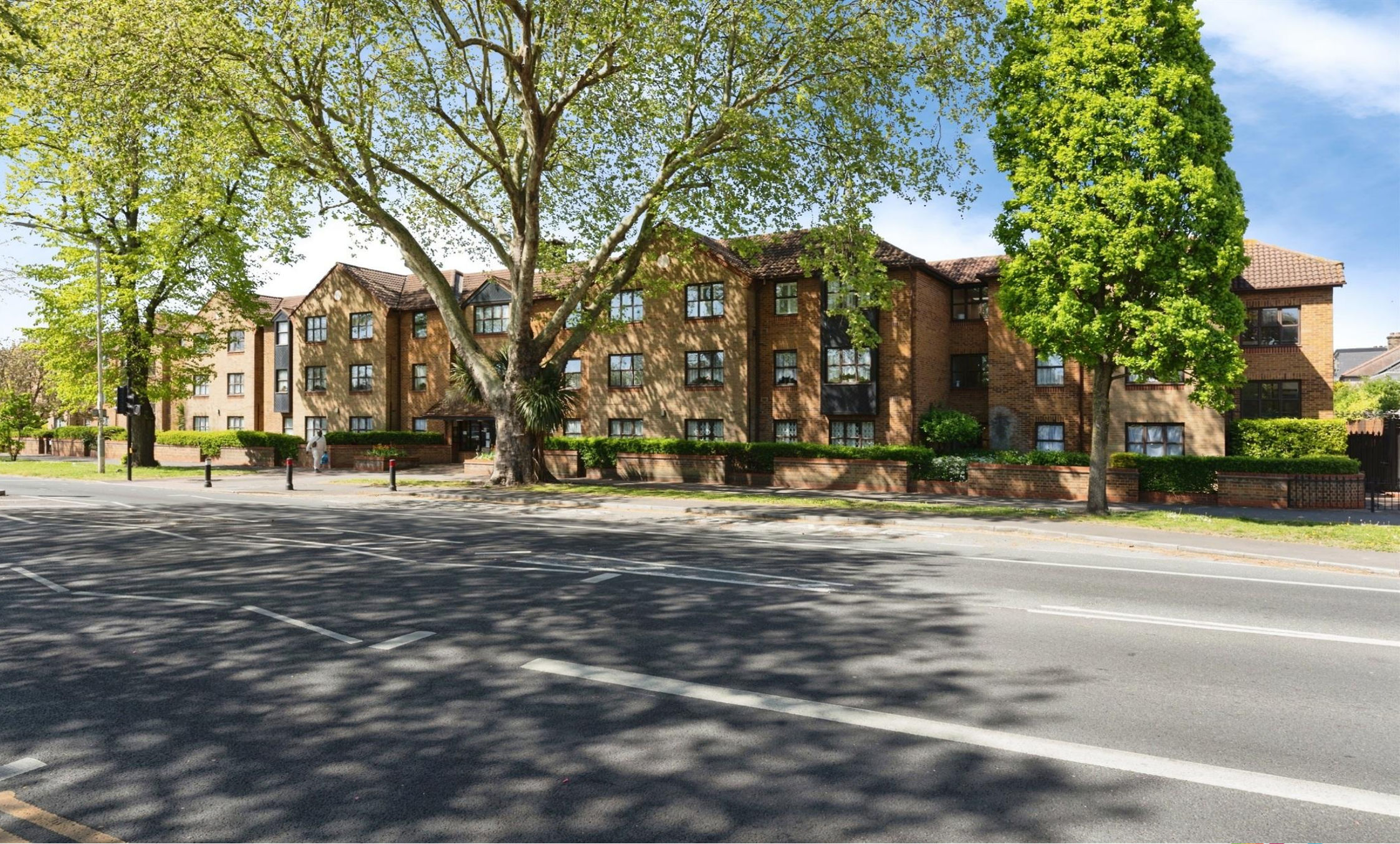
Cromwell Lodge, Longbridge Road, Barking, IG11 8UB