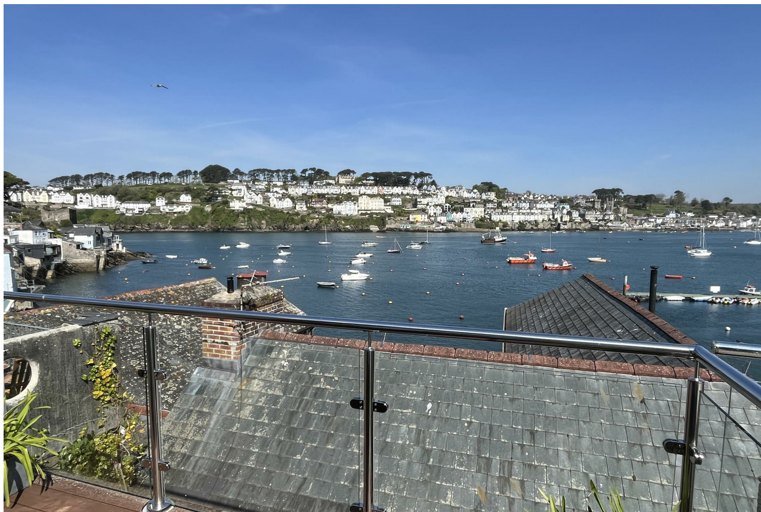
26 West Street, Polruan, PL23 1PJ