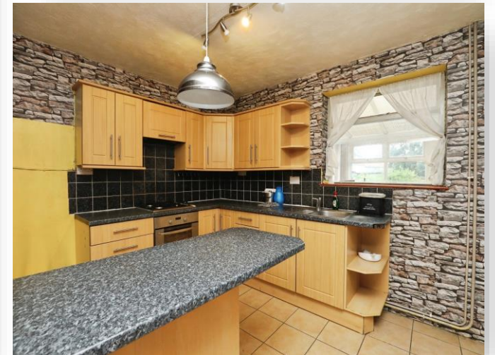
Harmer Road, Norwich, NR3 3QF