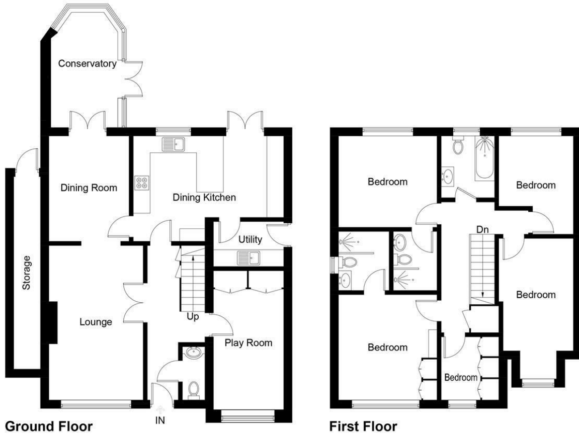
Illustration for identification purposes only, measurements are approximate, not to scale. Fourlabs.co © (ID1267092)

Approximate Gross Internal Area = 173.1 sq m / 1863 sq ft (Including Storage)