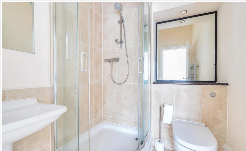
Bedroom Two En Suite