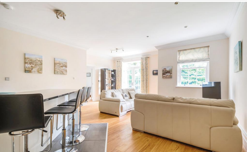
Open Plan Kitchen Dining Room