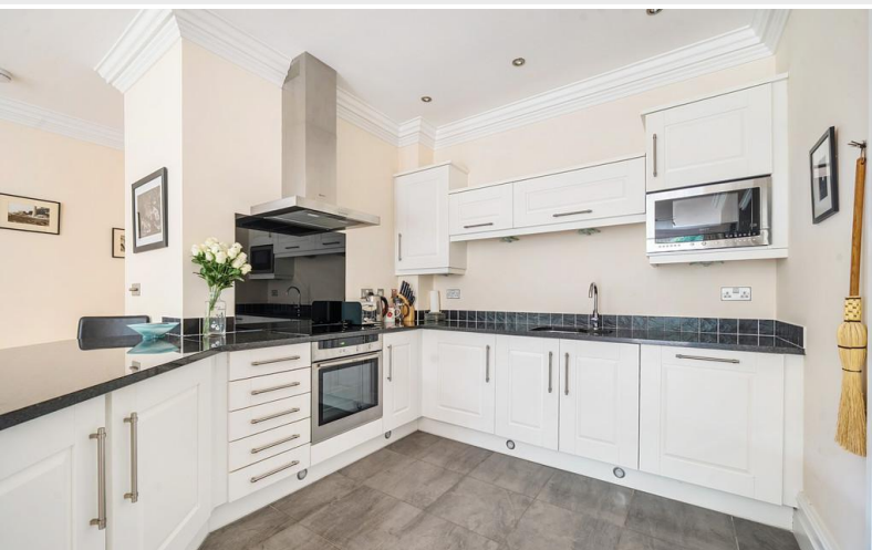
Open Plan Kitchen Dining Room