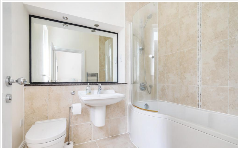
Bedroom One En Suite