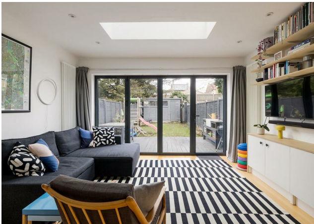
Reception Room 10'8" x 10'11"