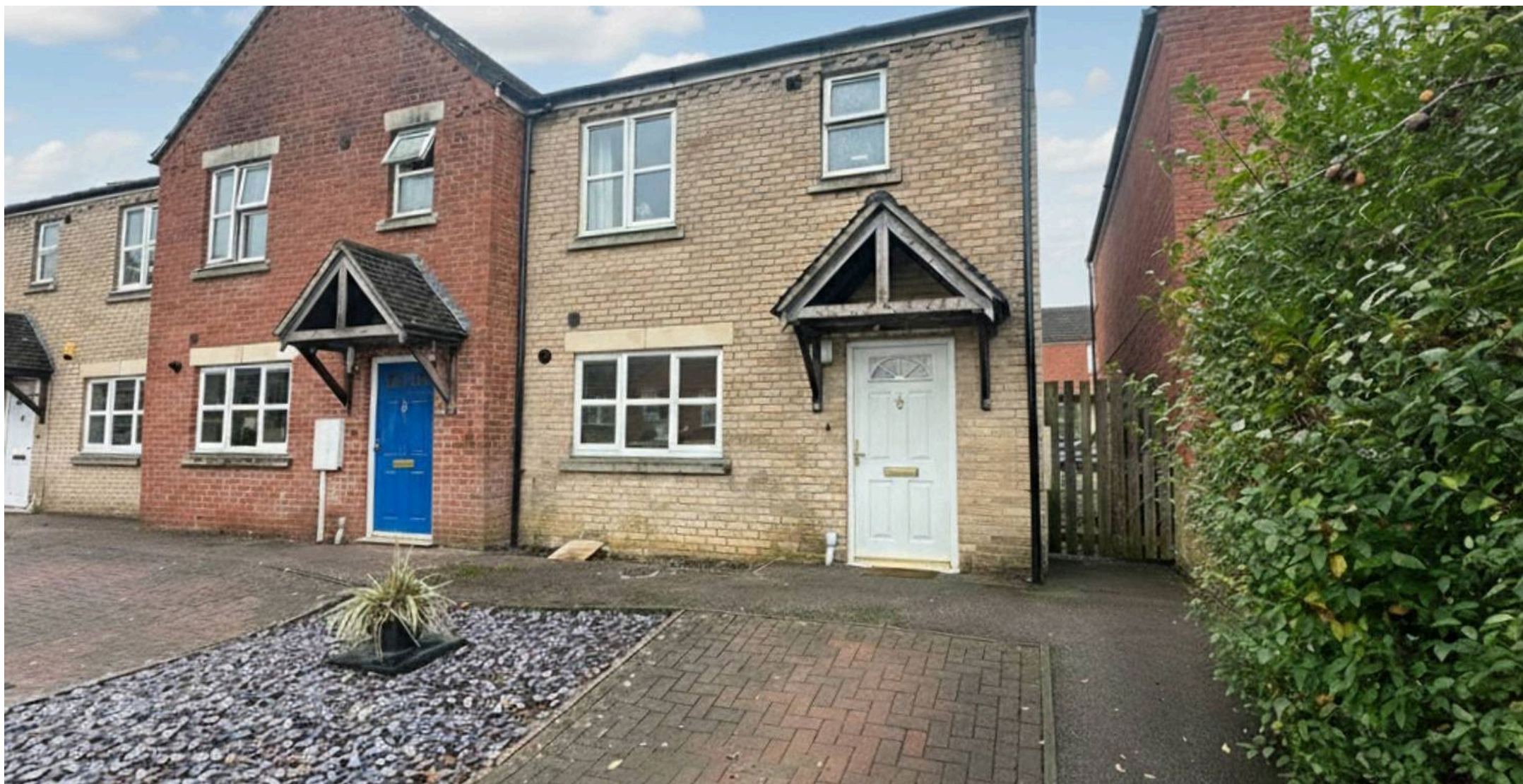
44 Harris Way, Grantham Grantham