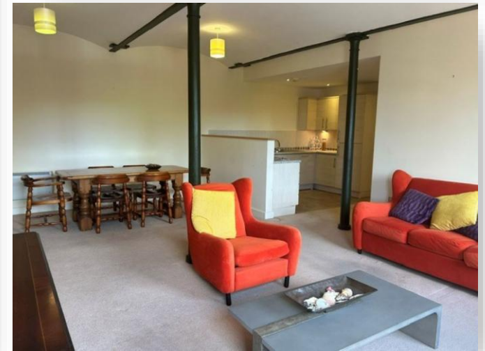
Tean Hall Mills, High Street, Tean, Stoke-On-Trent. ST10 4FF