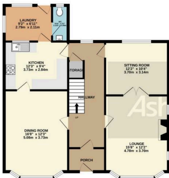
GROUND FLOOR 881 sq.ft. (81.8 sq.m.) approx.