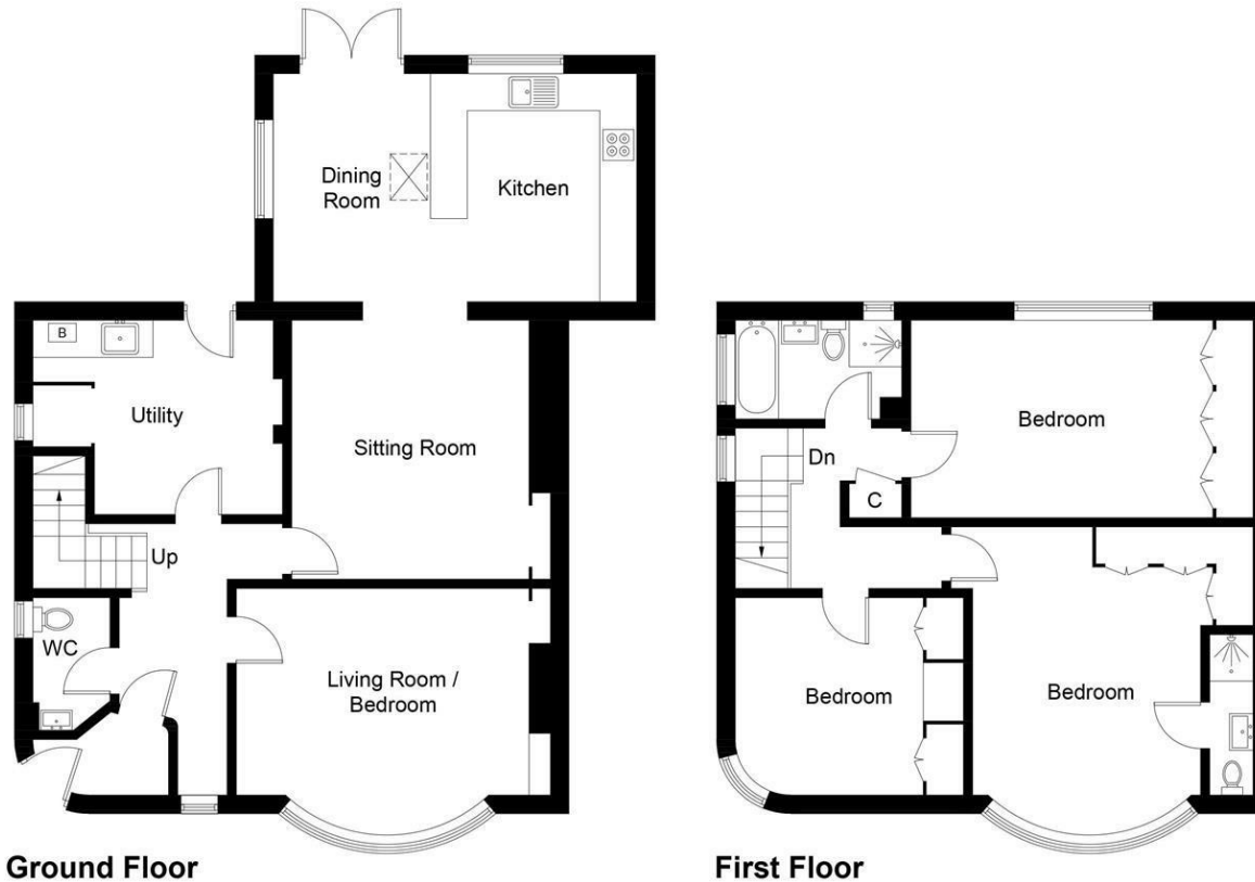
Illustration for identification purposes only, measurements are approximate, not to scale. (ID1289649)