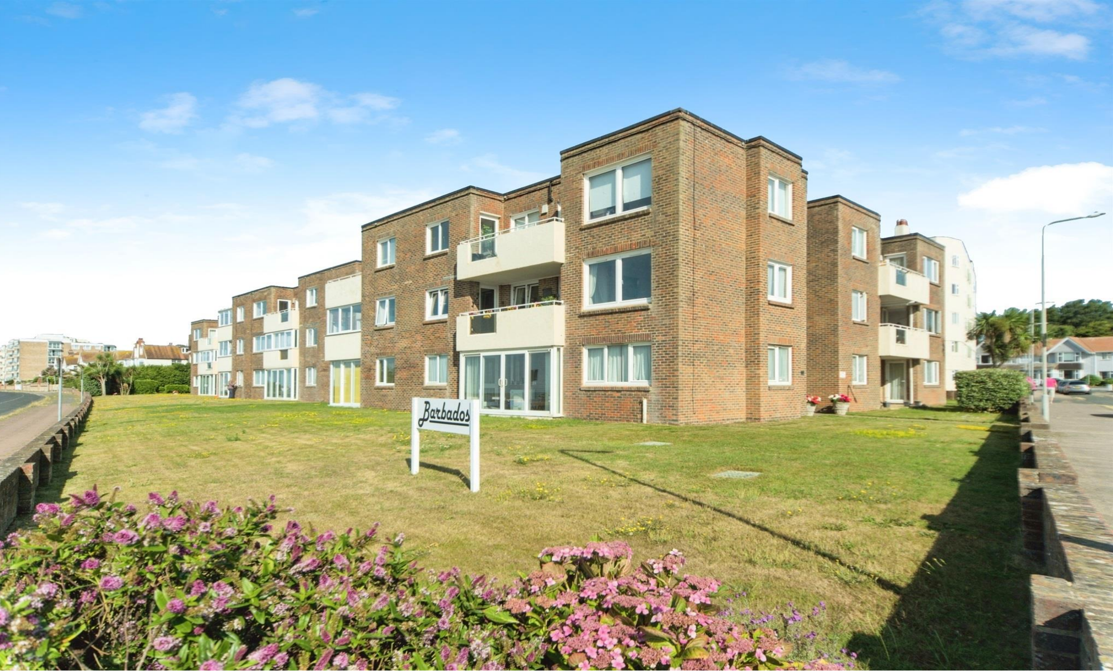
Barbados De La Warr Parade, Bexhill-On-Sea TN40 1PJ