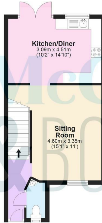
Ground Floor Approx. 38.1 sq. metres (410.4 sq. feet)