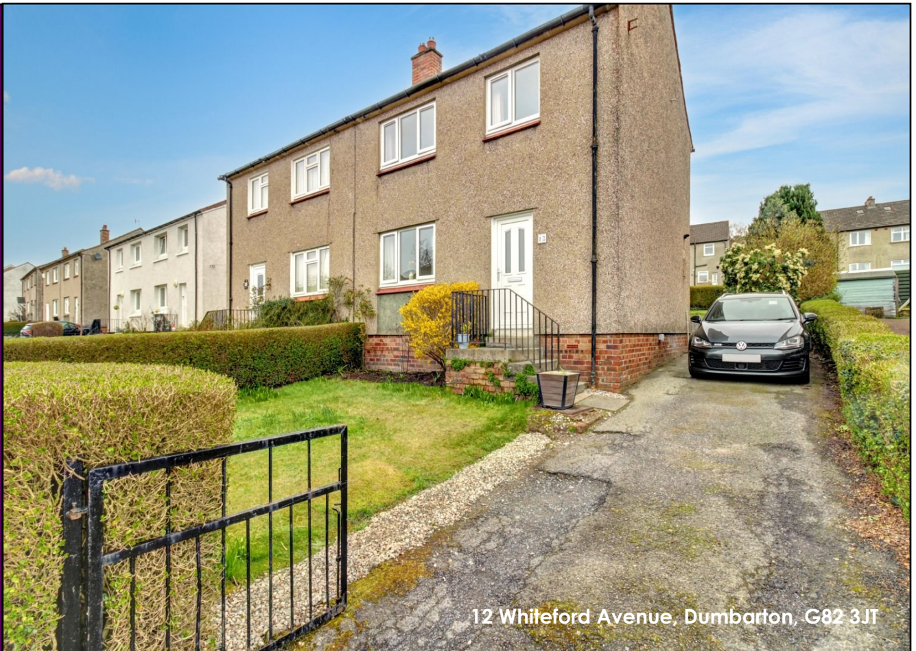
12 Whiteford Avenue, Dumbarton, G82 3JT

David Muir Estates are delighted to bring to the market this beautifully presented three-bedroom semi-detached villa, located within the ever-popular Whiteford Avenue area of Dumbarton. This ideal family home offers generous accommodation, modern upgrades, and excellent outdoor space.