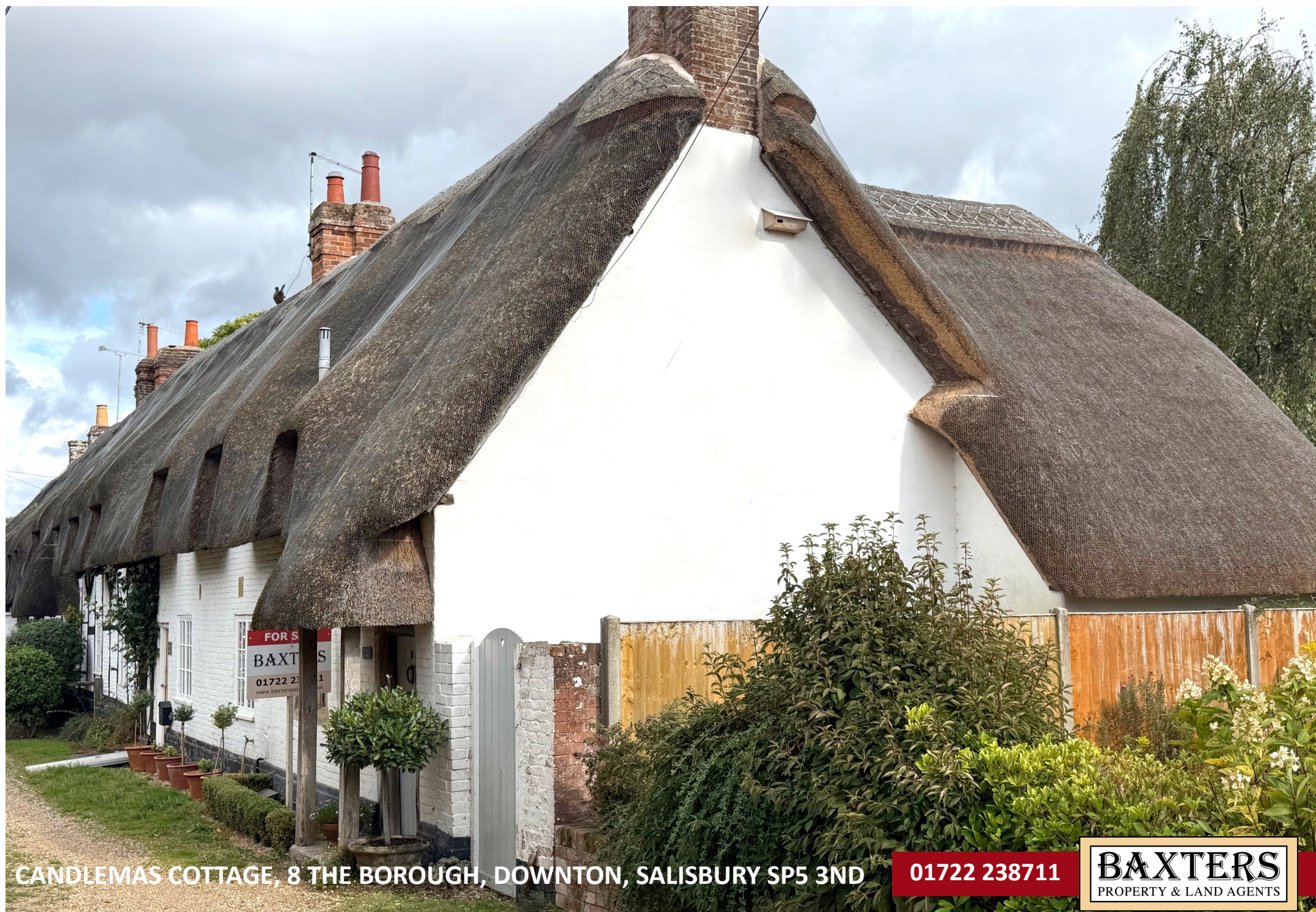
CANDLEMAS COTTAGE, 8 THE BOROUGH, DOWNTON, SALISBURY SP5 3ND