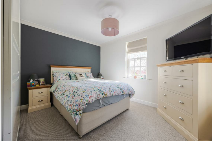
Bedroom three 11'10" x 10'4" (3.63 x 3.16)