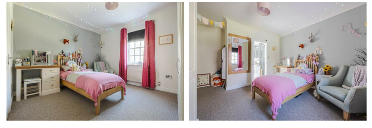
Bedroom one 15'3" x 12'1" (4.66 x 3.70)