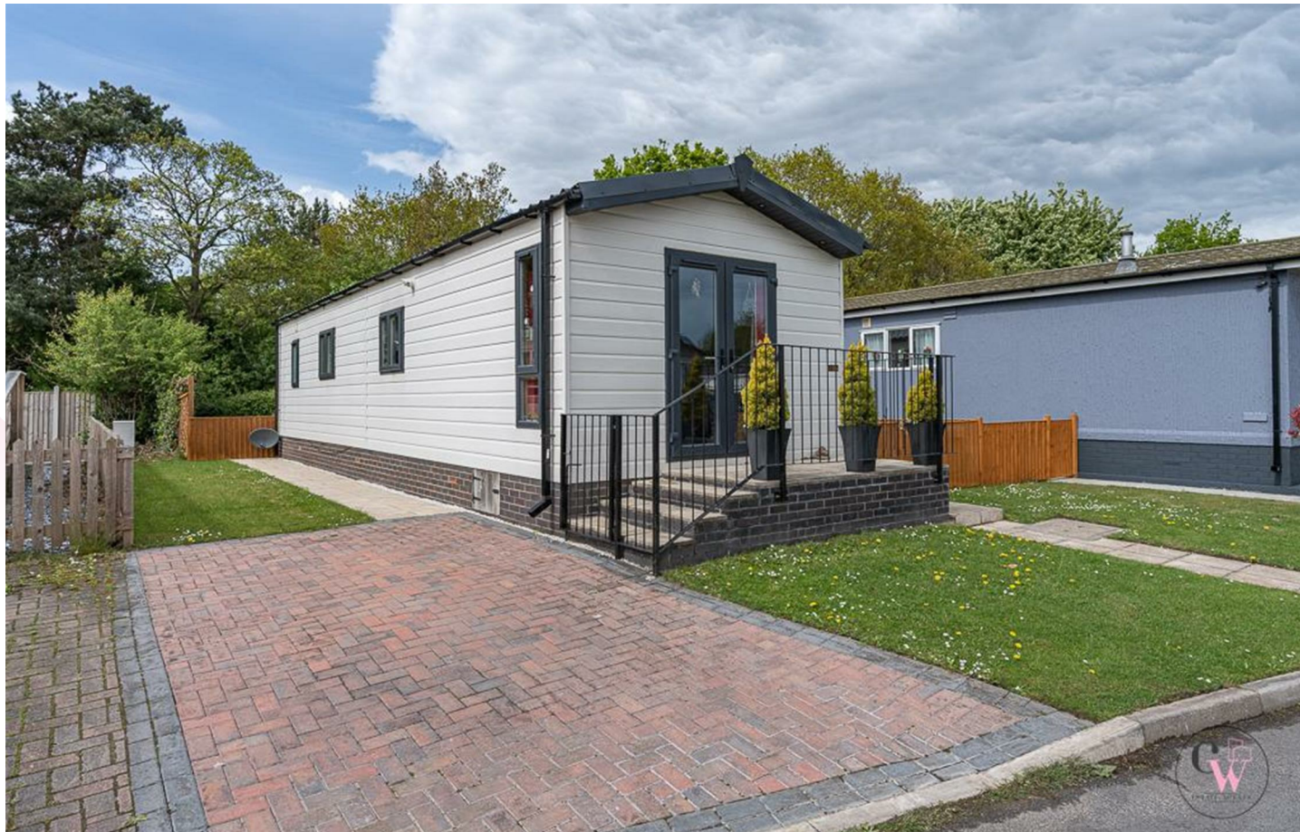
Lee Green Lane, Church Minshull, Nantwich CW5 6ED