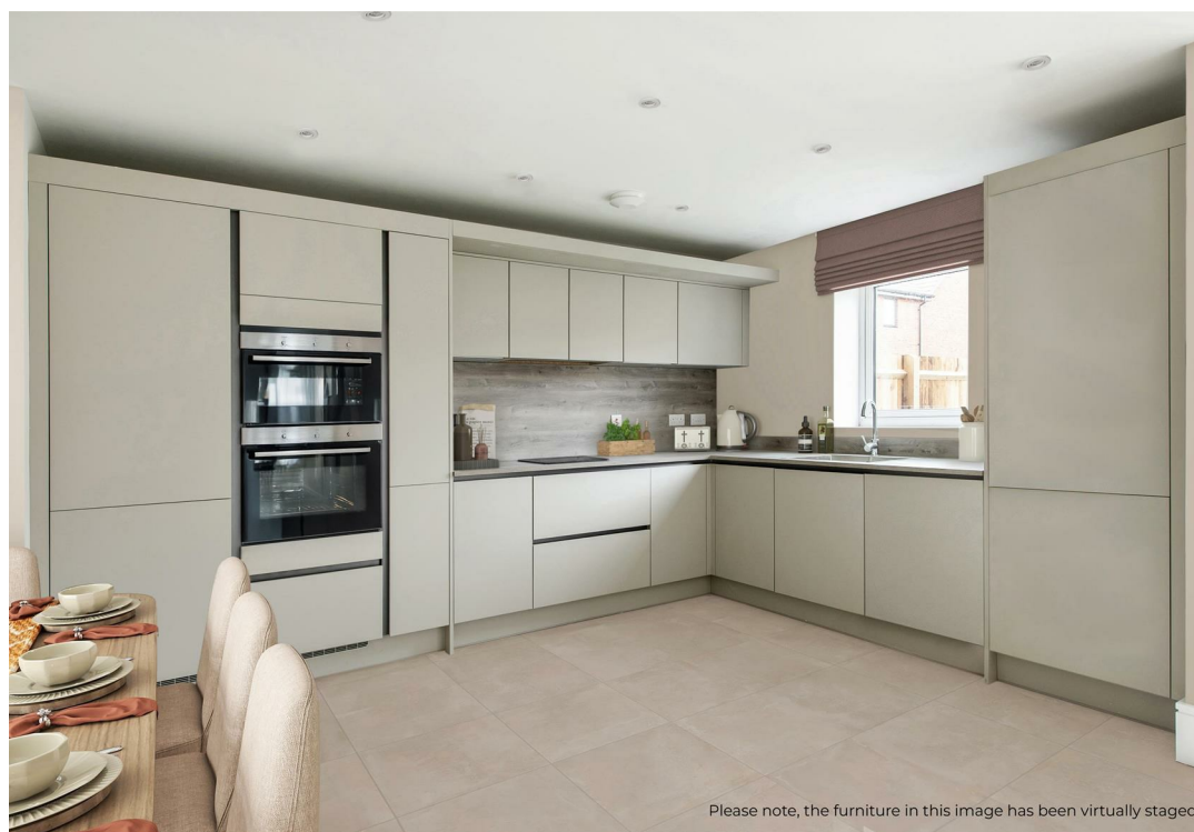
Please note, the furniture in this image has been virtually staged.