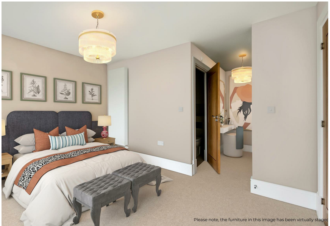
Please note, the furniture in this image has been virtually staged