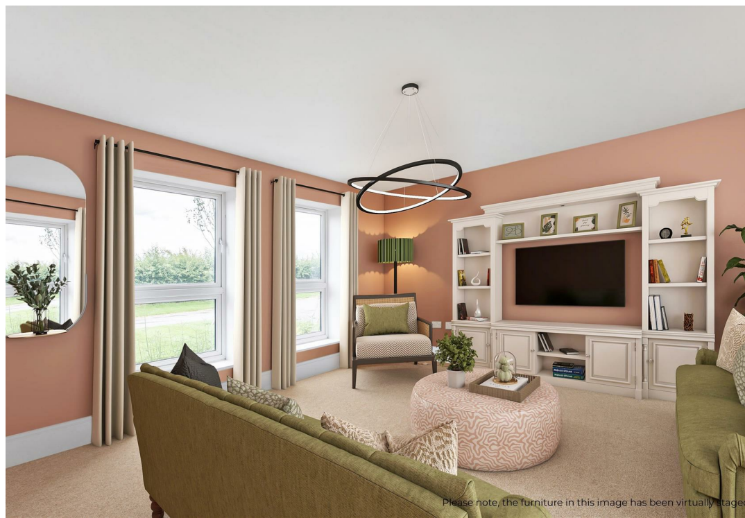
Please note, the furniture in this image has been virtually staged