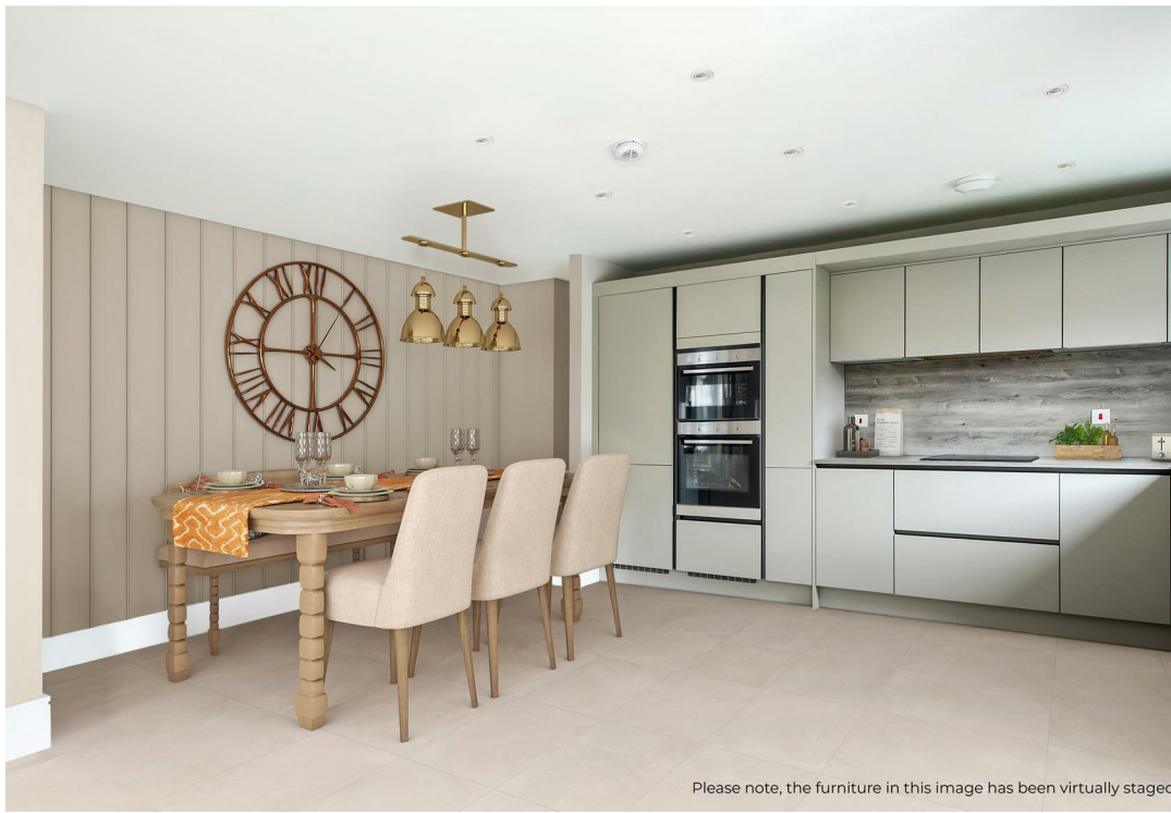
Please note, the furniture in this image has been virtually staged.