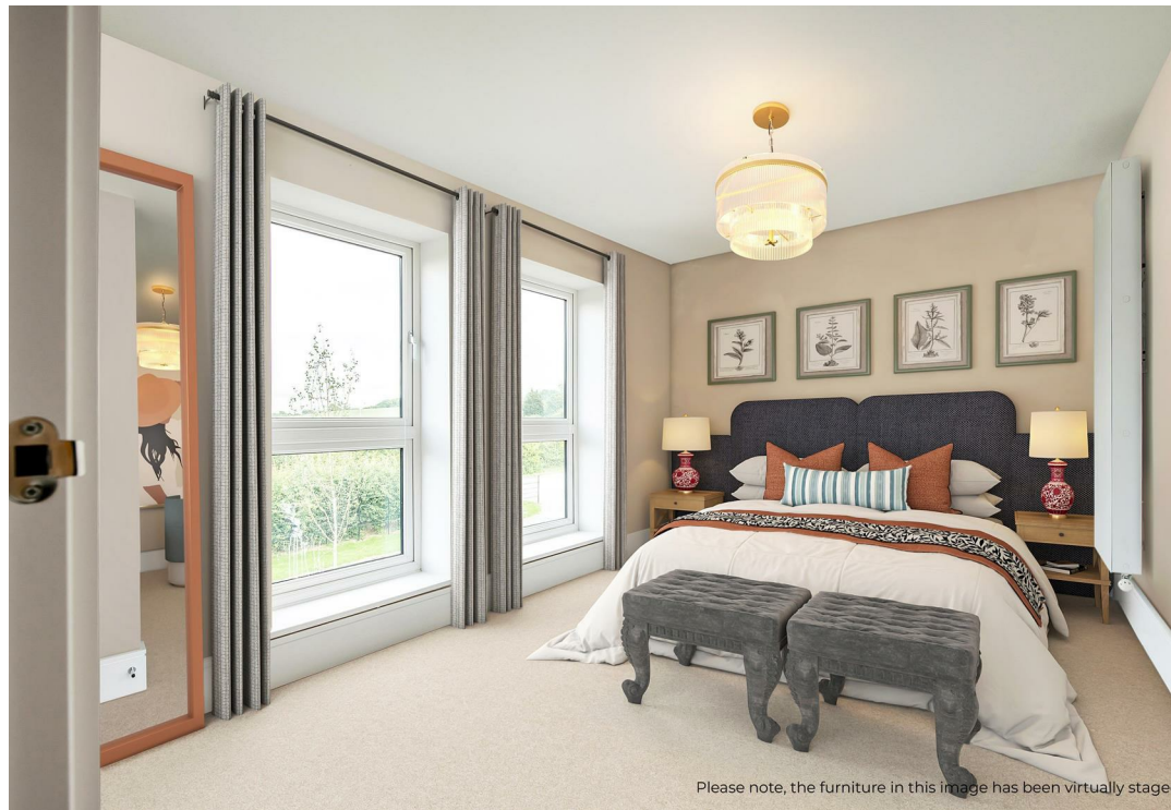
Please note, the furniture in this image has been virtually staged