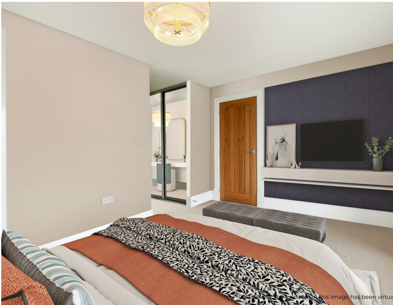
Presented in this image has been virtually