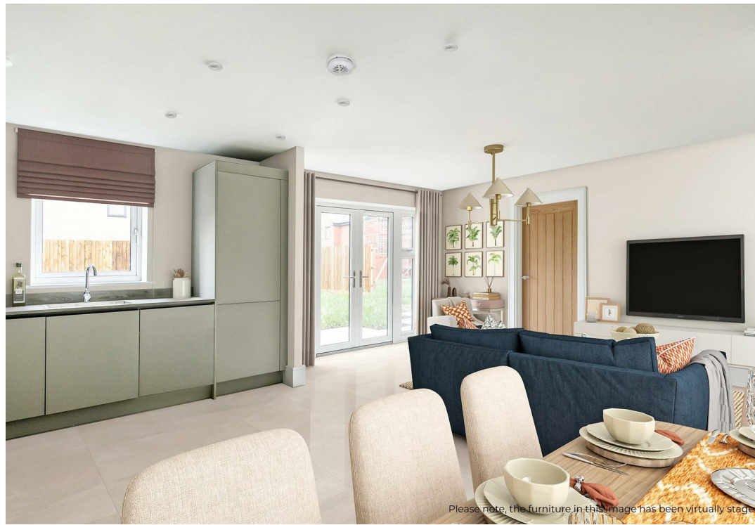
Please note, the furniture in this image has been virtually staged.