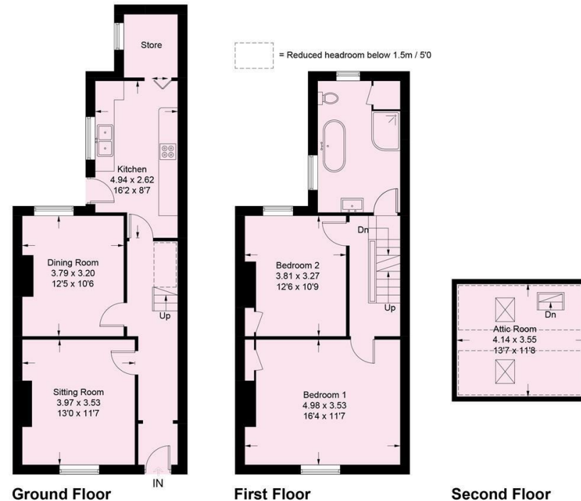
illustration for identification purposes only. measurements are approximate, not to scale Pursuant to RICS Property Measurement 2nd Edition © Intelligent Property Marketing 2026