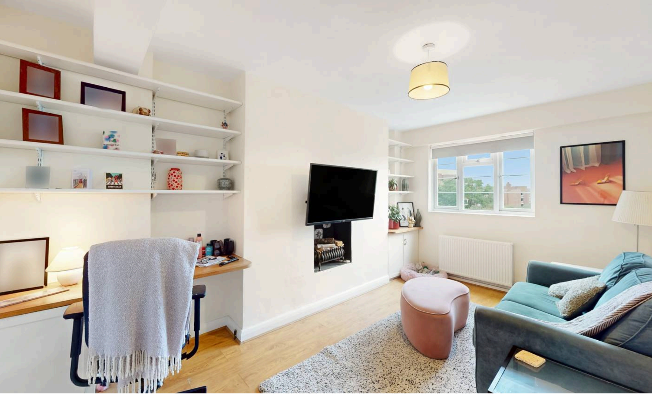
Hanover Court, Shepherds Bush, W12 £2,150 pcm