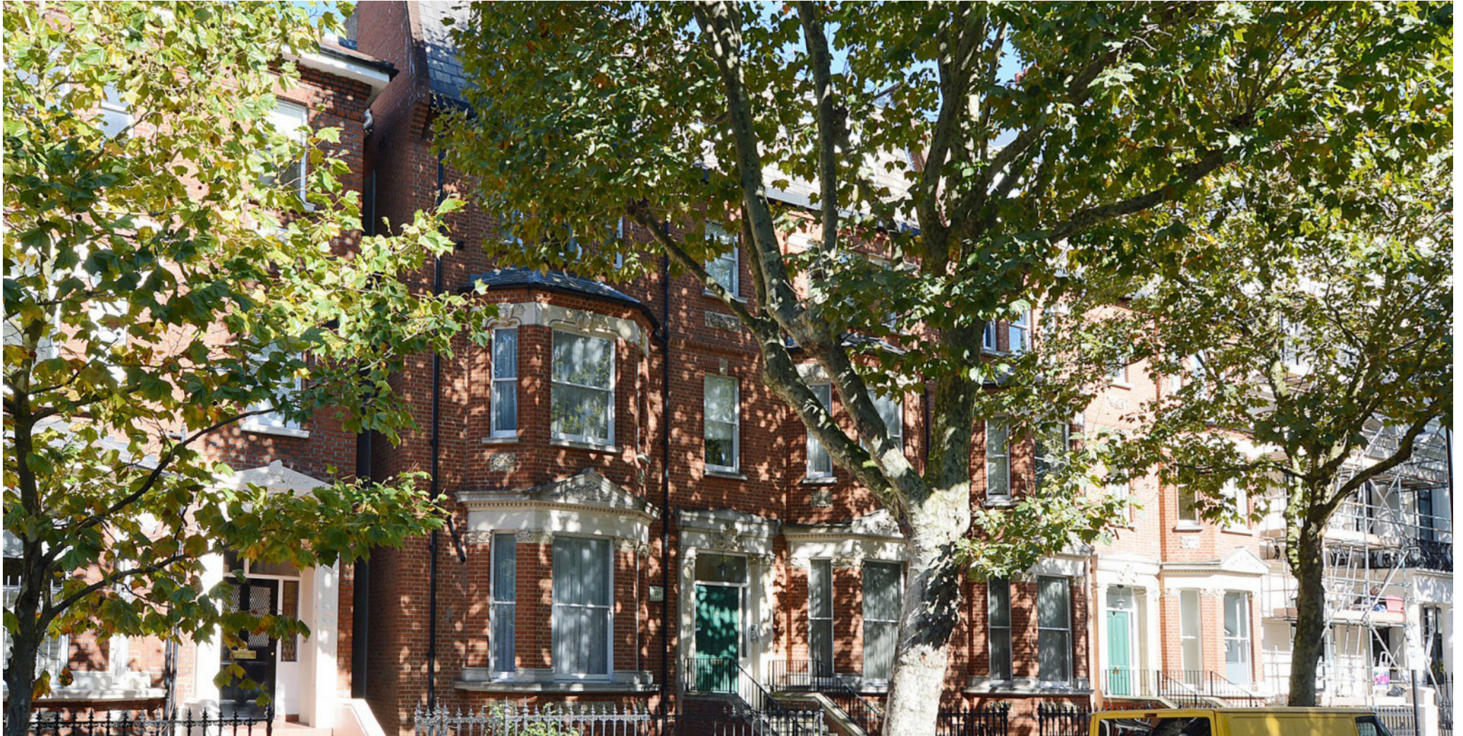
SUTHERLAND AVENUE, London W9