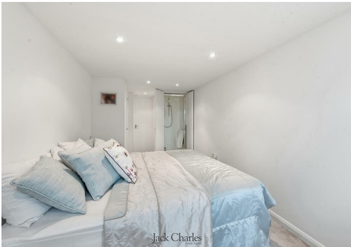
Jack Charles Estate Agents