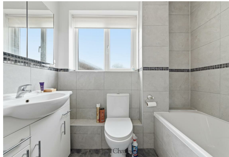
Jack Charles Estate Agents