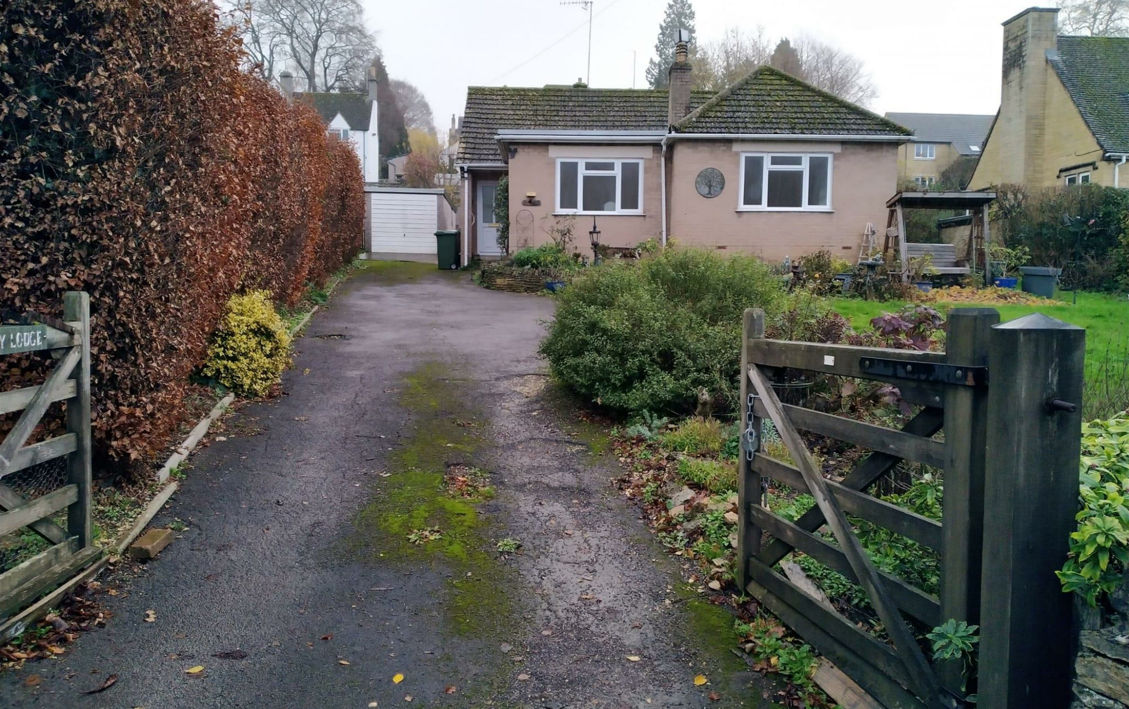
Grey Lodge · London Road · · Stroud