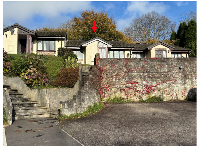
PARKING AND FRONT ELEVATION