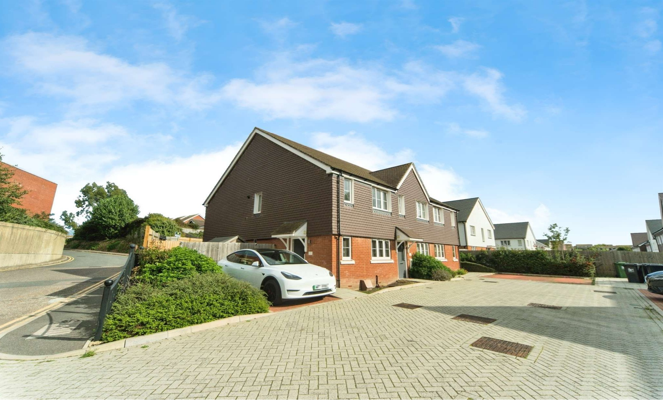
Avebury Mews, Eastbourne BN23 7FA