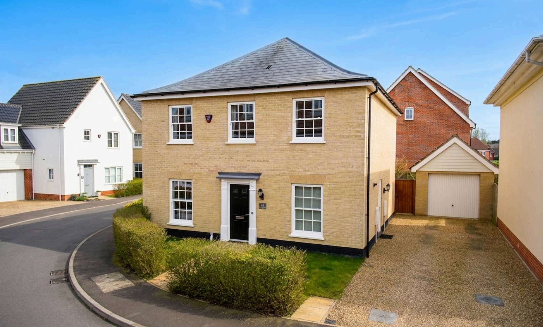
Avocet Rise, Sprowston - NR7 8ES