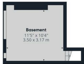
Floor -1 Building 1